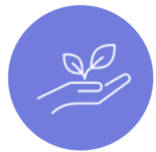
Environmental & Forestry