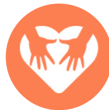
Social Enterprise & Third Sector