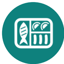
Food & Drink