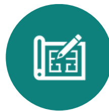
Engineering & Technology